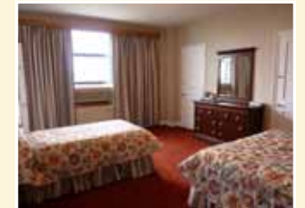
Renovated room (2014)

The work is following a cohesive, sequential plan, allowing for the use of the rooms during the summer. Masonry work has begun, and seven rooms have been renovated!