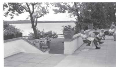
Veranda outside Roger Williams Inn